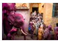
16. ELLIE AND WIDOWS