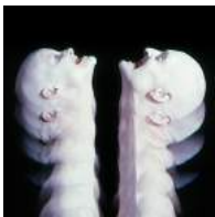
11. RATIONAL THEATRE