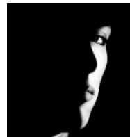
13. KICK BACK