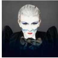
3. STEVE STRANGE