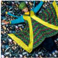
6. LEIGH BOWERY