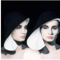
2. SONIA II