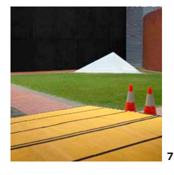
Francesca Johanson - Small Talk Edtion of 5 + AP Archival photographic print 49.5 x 49.5 cm $1250 unframed $1450 framed*