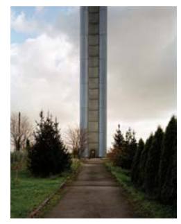
Tom Evangelidis - Blue Tower, Prague 1998 Paper size 148 x 122 Edition of 10+ AP Unframed $2500 Framed $3250*