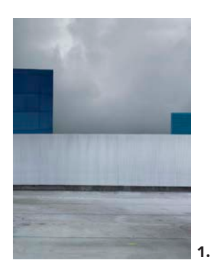
David Manley - Blue Structures, 2013 Archival photographic print, 1250 x 1000 mm Edition of 4 Framed $2850 Unframed $1890