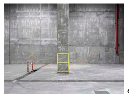
Peter Clarke - The Age Edtion of 3 + AP Paper size 148 x 122 cm $1650 unframed $2500 framed