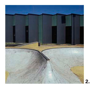
Dainna Wells - Taylors Hill #1 Pigment print on cotton rag 100 x 100 cm Edition of 6 Framed $3500 Unframed $2900