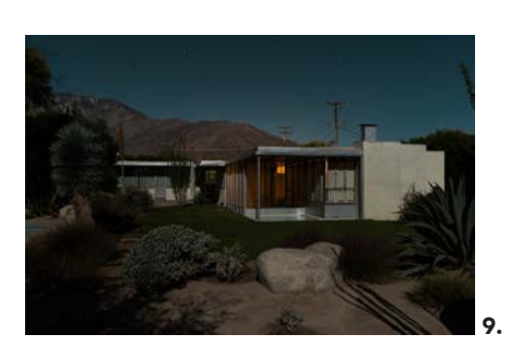
Tom Blachford - 2311 N Indian Avenue Edition of 10 134 x 90 cm Unframed $2200 Framed $3500