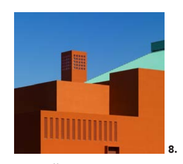
Tim Griffith - Still Edtion of 5 + AP 148 x 122 cm (paper size) Unframed $2500 Framed $3250