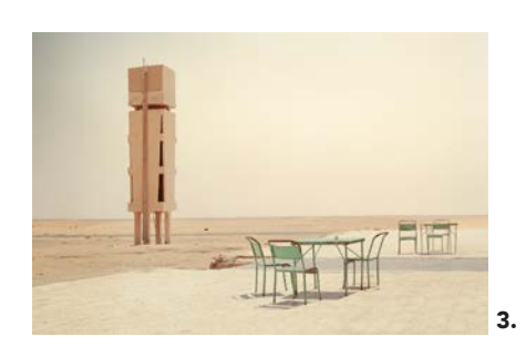
Chris Sisarich - Water Tower Baharia Rd. Egypt 594 x 841 mm Edition of 10 Framed $1250