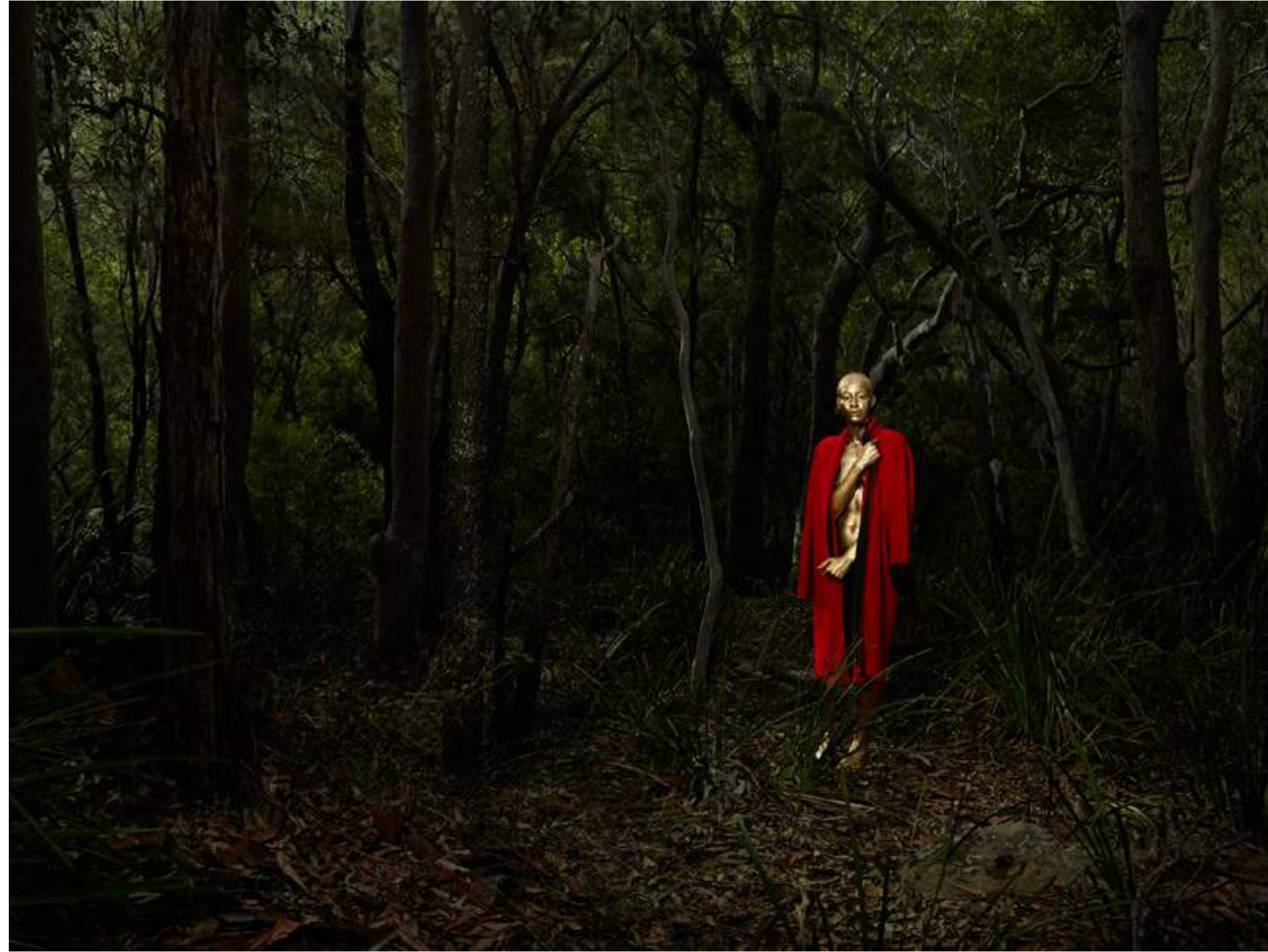
THORNLEIGH #3, 2016

Inkjet Print, Edition of 3 + AP 150 x 200 cm