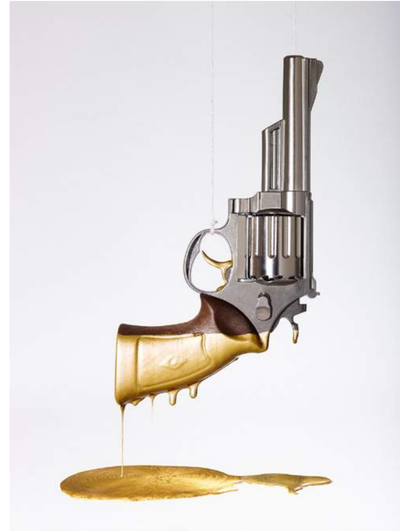
GOLD PISTOL, 2016

Inkjet Print, Edition of 3 + AP 150 x 200 cm