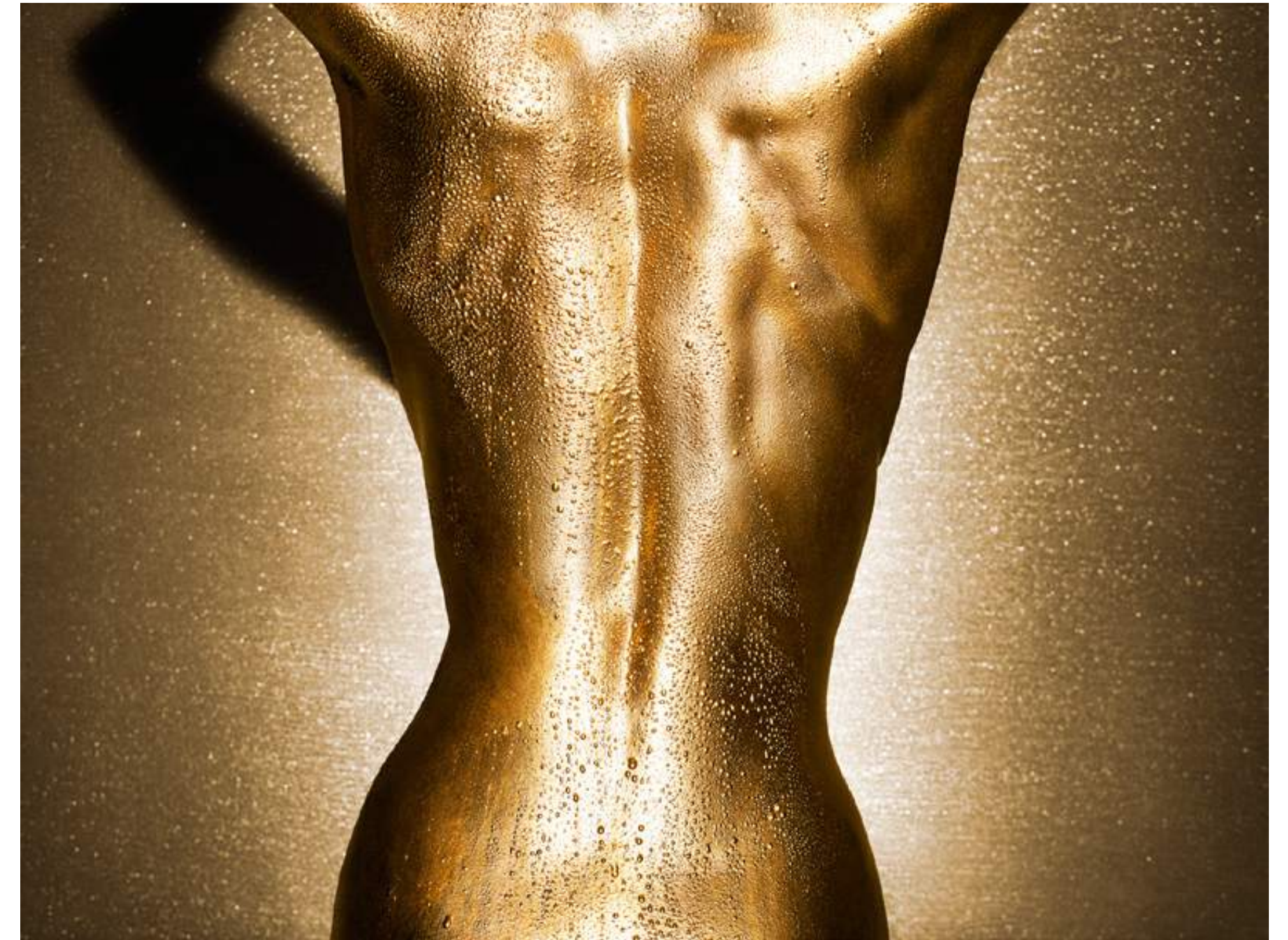
LUCY #4, 2016

Inkjet Print, Edition of 3 + AP 150 x 200 cm