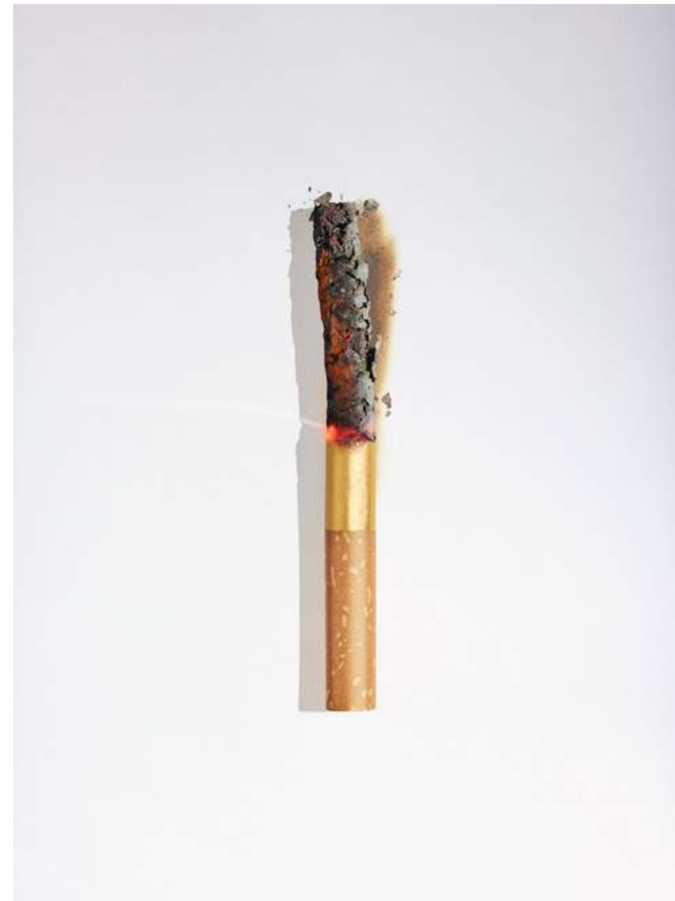
GOLD CIGARETTE, 2016

Inkjet Print, Edition of 3 + AP 150 x 200 cm