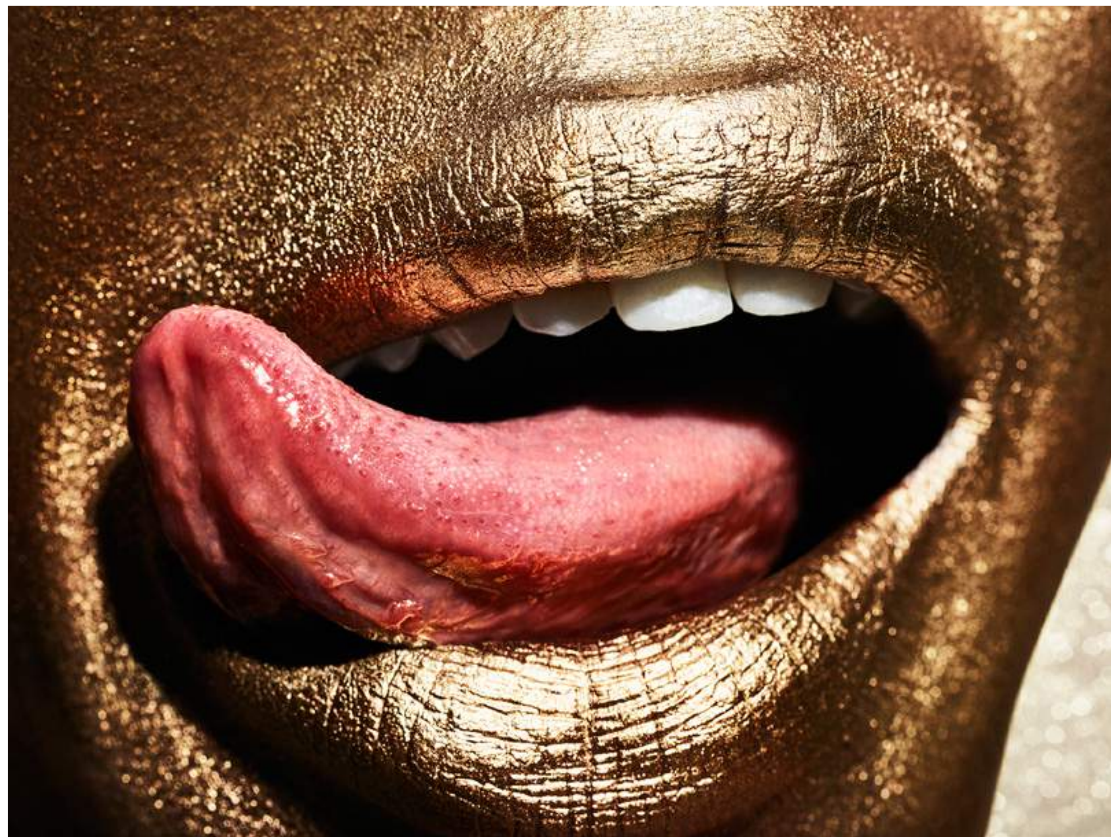
LUCY #1, 2016

Inkjet Print, Edition of 3 + AP 150 x 200 cm