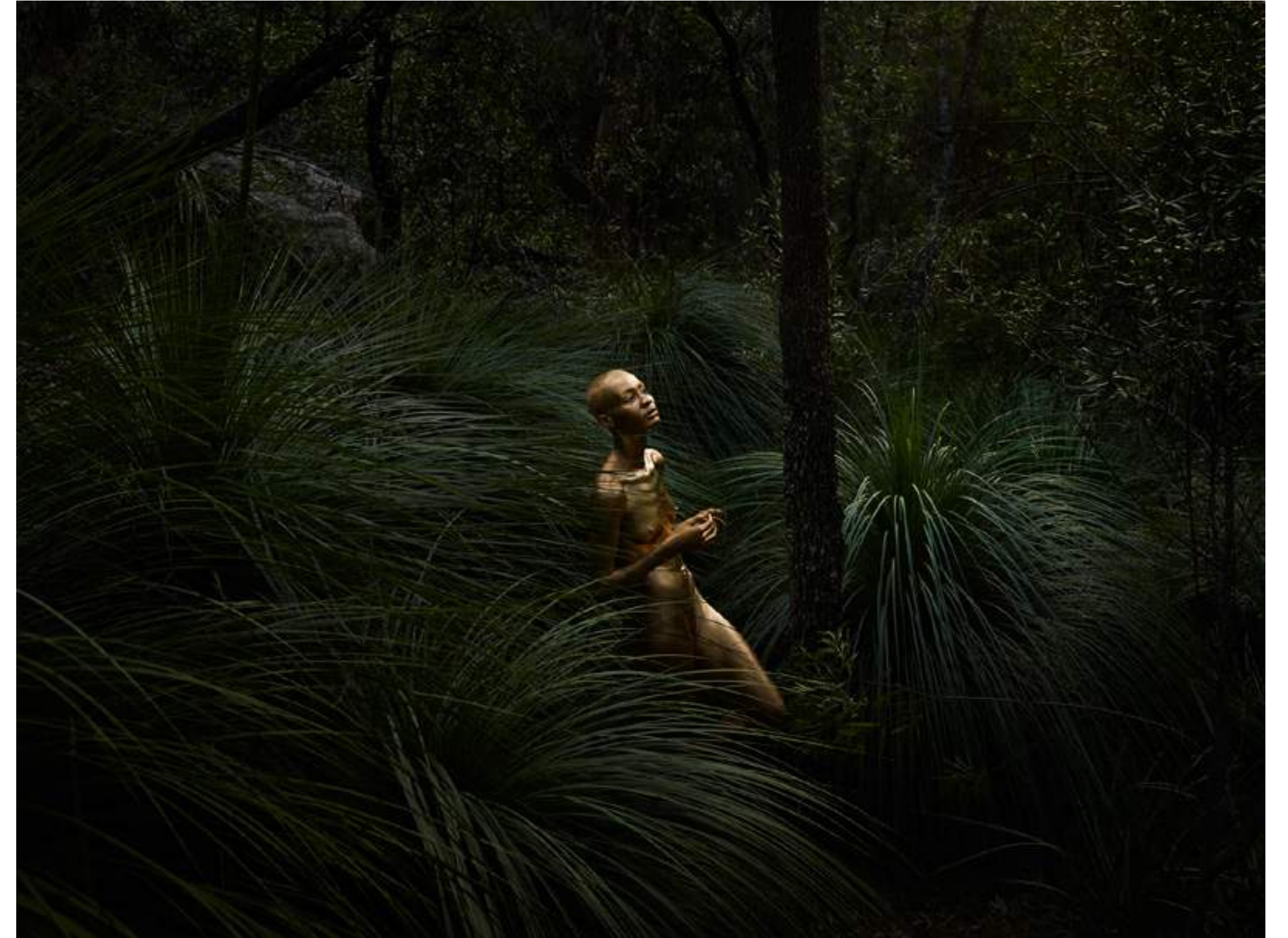
THORNLEIGH #2, 2016

Inkjet Print, Edition of 3 + AP 150 x 200 cm