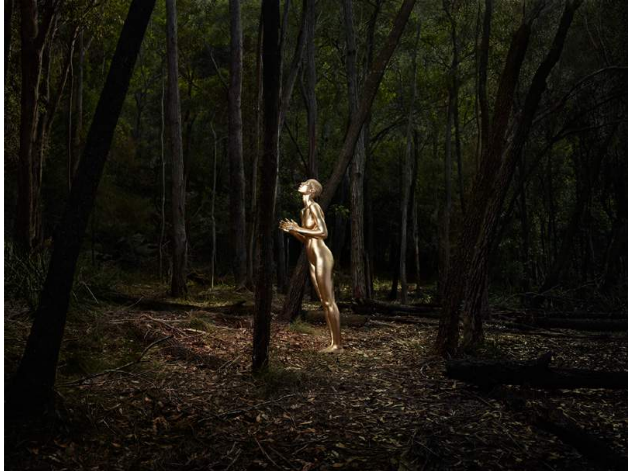
THORNLEIGH #1, 2016

Inkjet Print, Edition of 3 + AP 150 x 200 cm