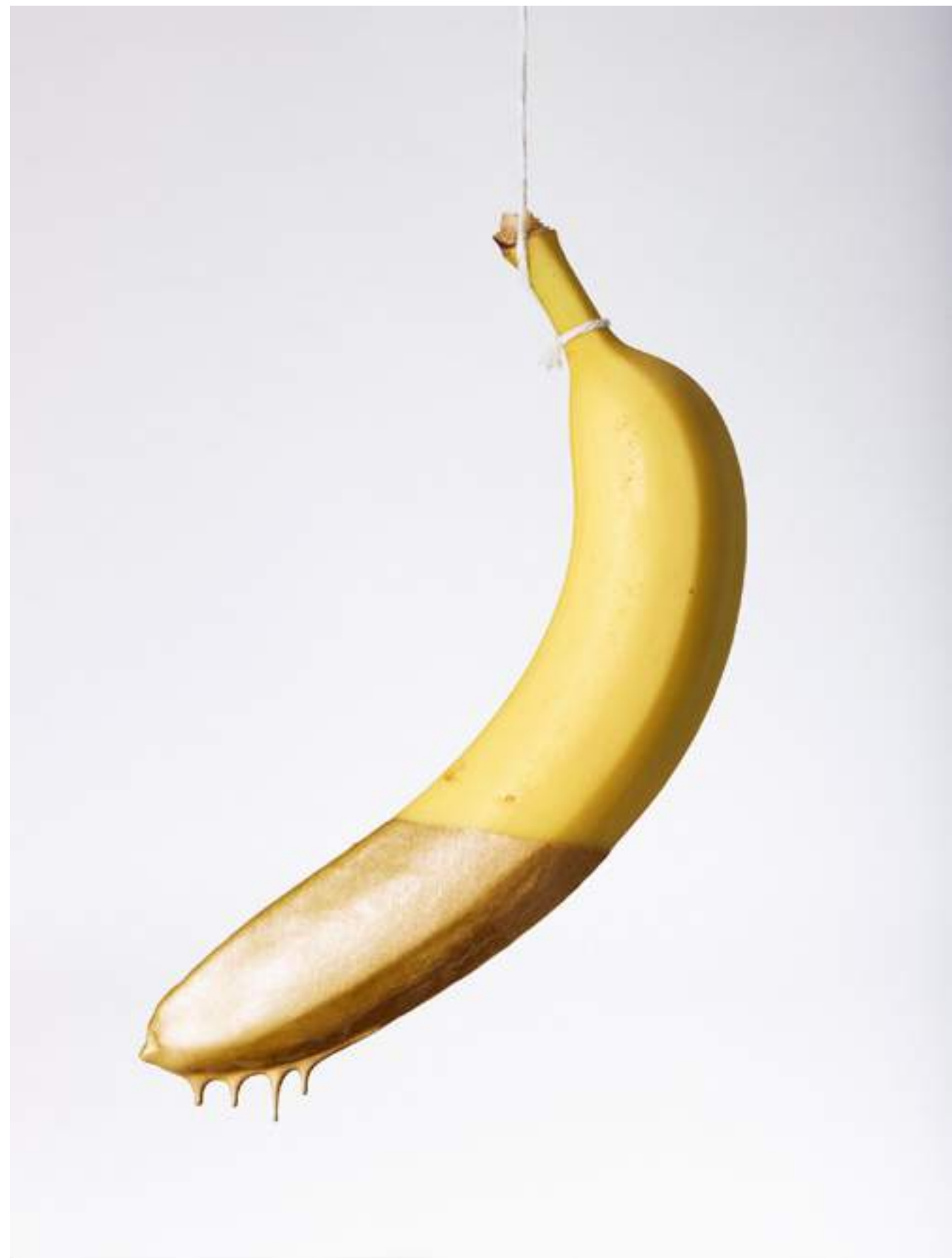
GOLD BANANA, 2016

Inkjet Print, Edition of 3 + AP 150 x 200 cm