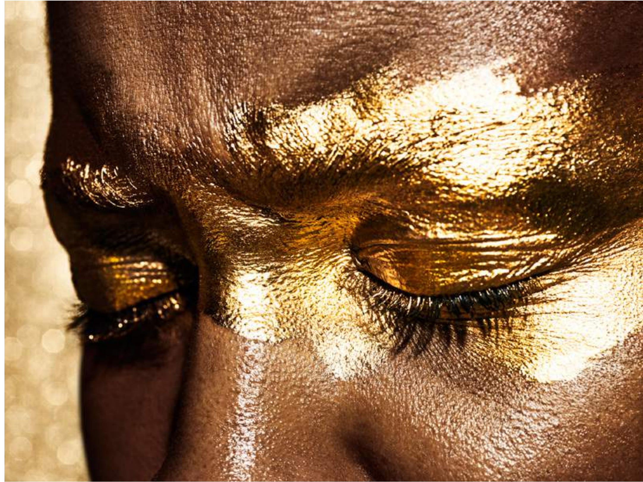
LUCY #5, 2016

Inkjet Print, Edition of 3 + AP 150 x 200 cm