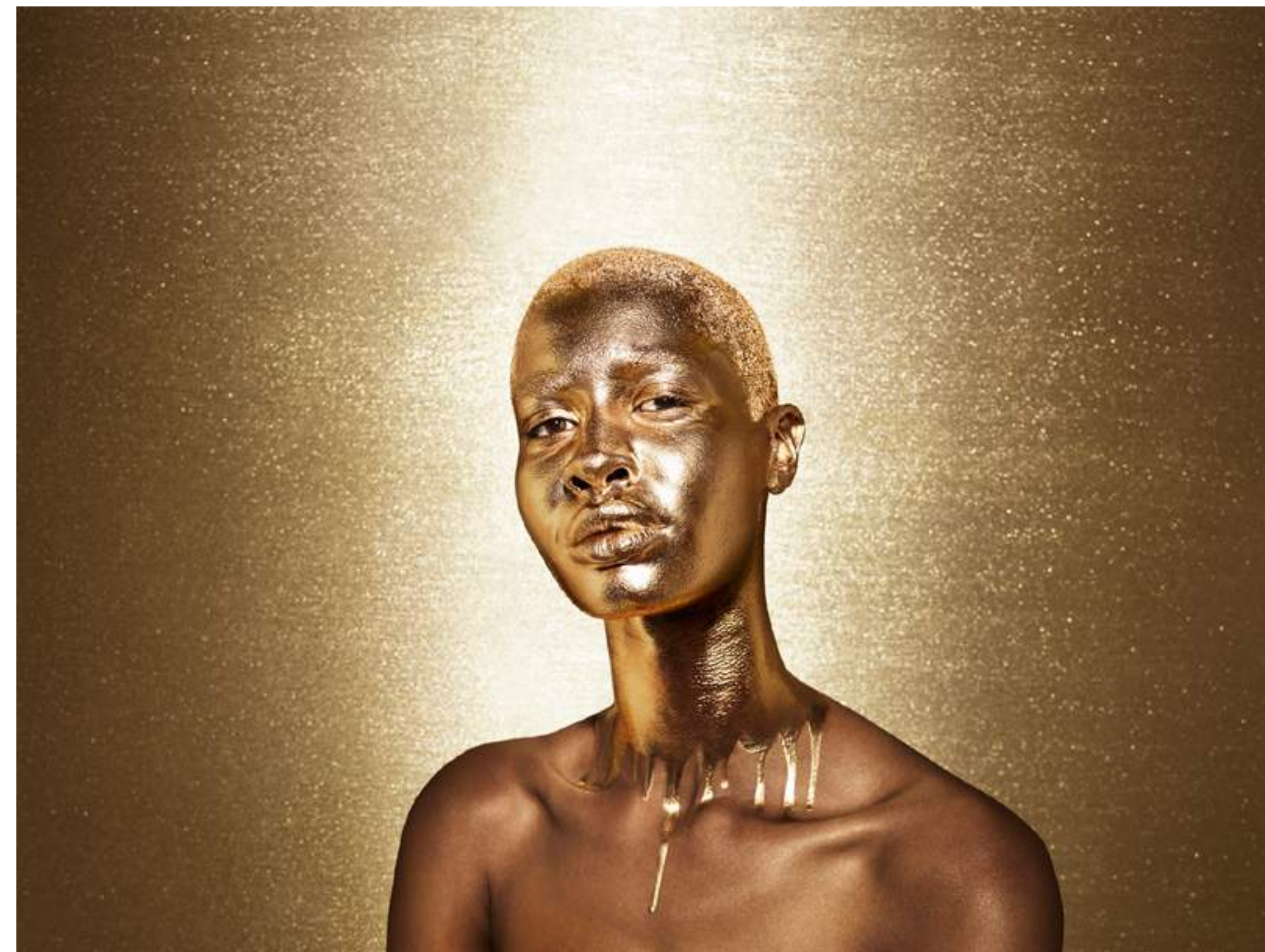
LUCY #2, 2016

Inkjet Print, Edition of 3 + AP 150 x 200 cm