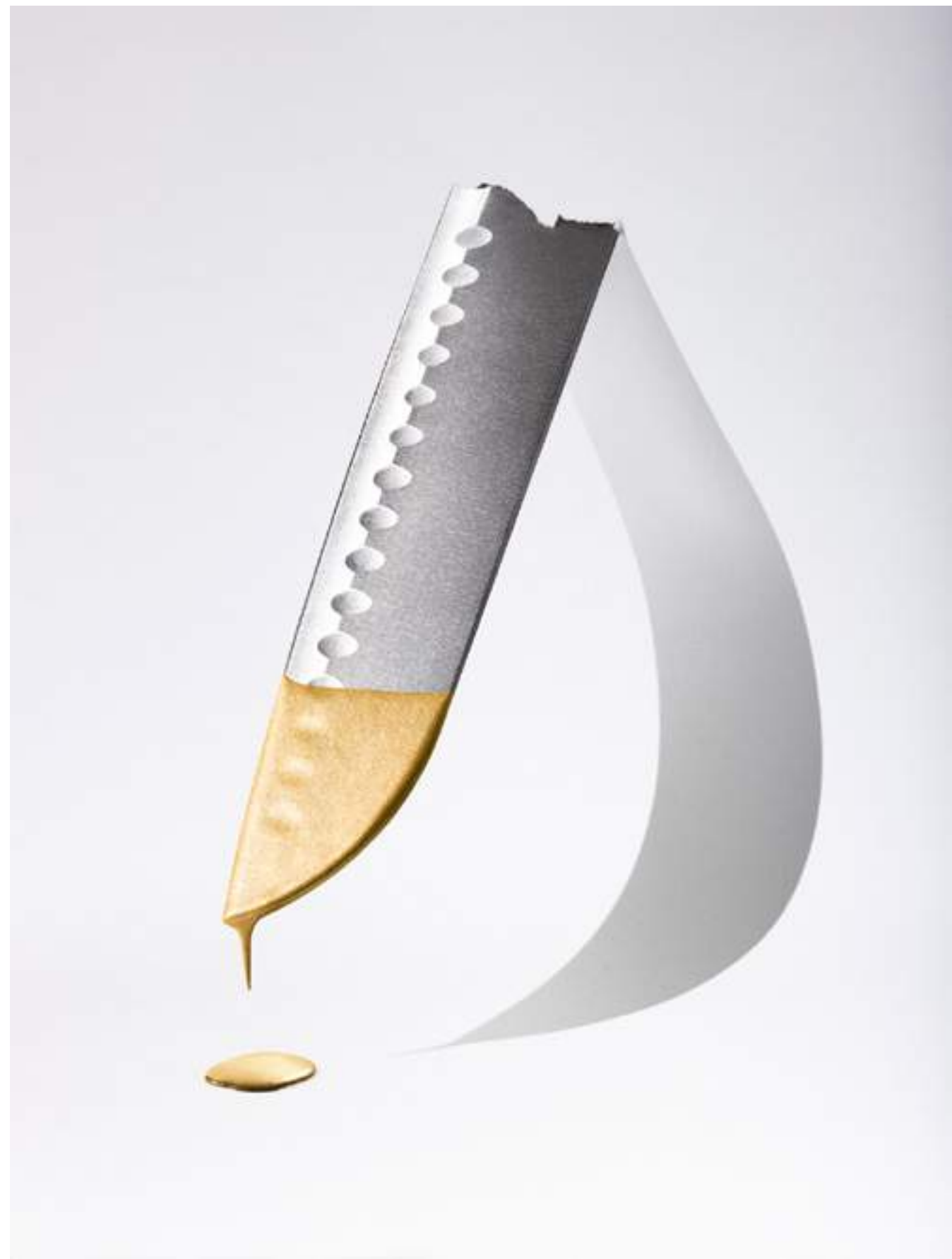
GOLD KNIFE, 2016

Inkjet Print, Edition of 3 + AP 150 x 200 cm