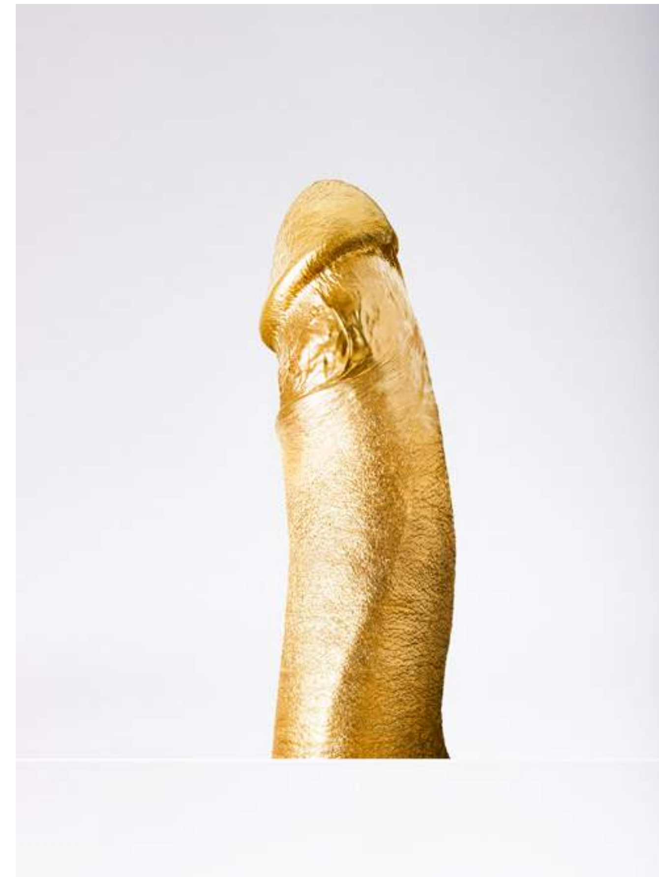
GOLD PENIS, 2016

Inkjet Print, Edition of 3 + AP 150 x 200 cm