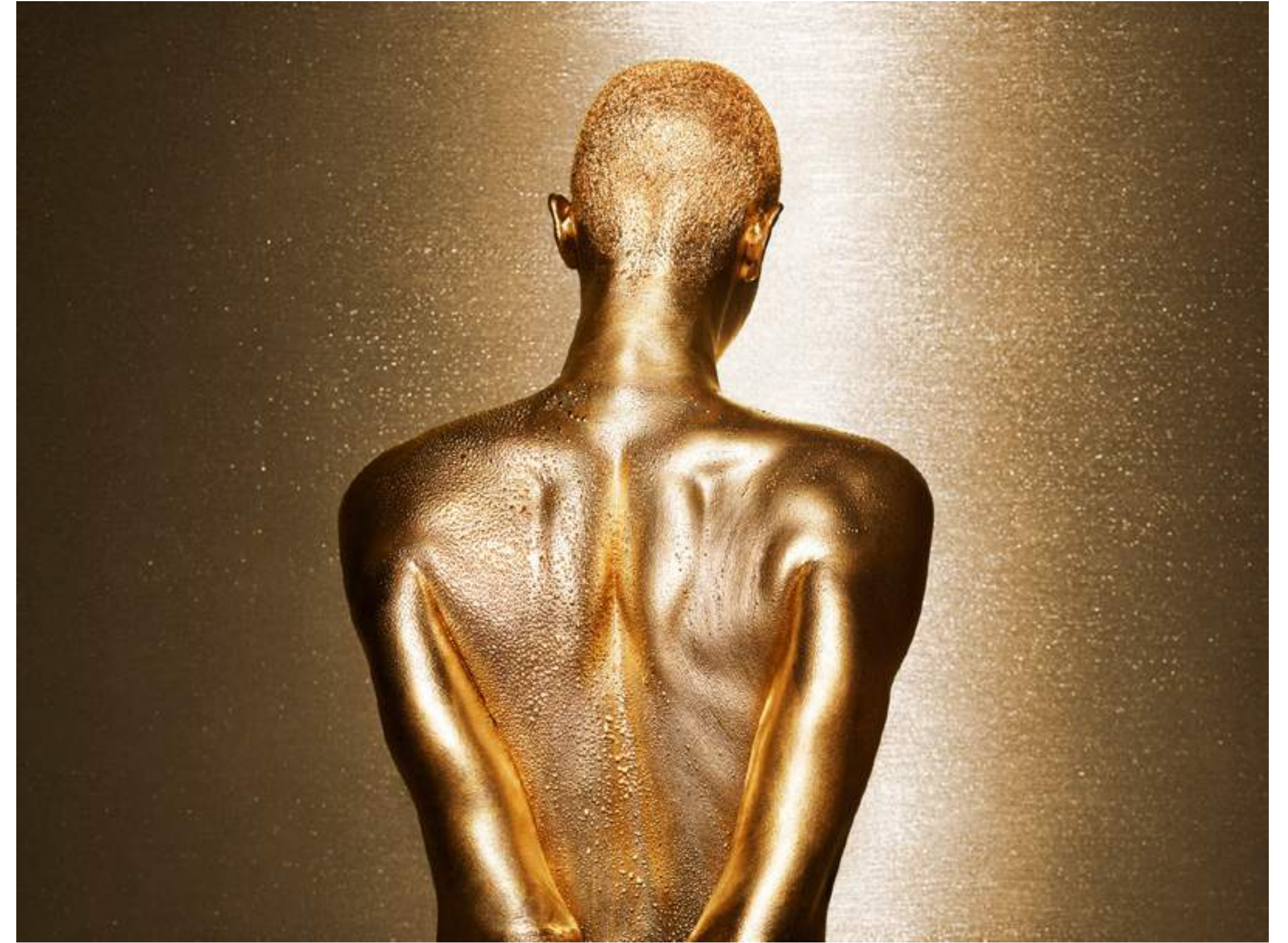
LUCY #6, 2016

Inkjet Print, Edition of 3 + AP 150 x 200 cm