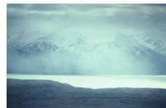
10 Fine mist above Lake Pukaki