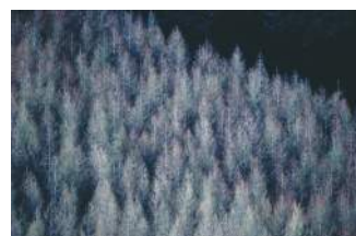
8 Forest at Hanmer Springs