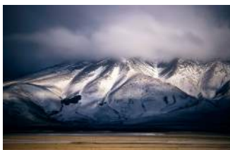
6 Mountain range near Lake Ohau