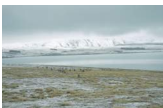
7 Sheep in snow by Lake Tekapo