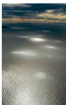
9 Foveaux Strait