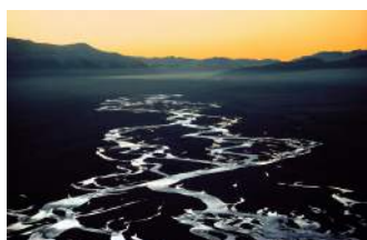
4 Rakaia River at dusk