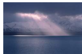
12 Diagonal light on Lake Pukaki