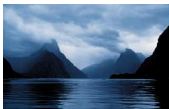
2 Milford Sound in Fiordland