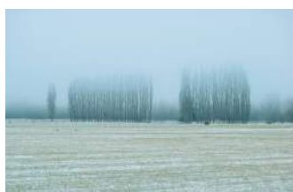
3 Poplars in mist near Geraldine