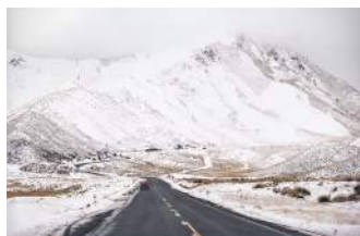
1 Lindis Pass in snow