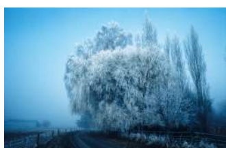
5 Hoarfrost covered farm in Twizel