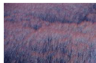
11 Autumn treetops near Tarras